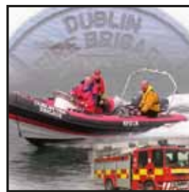
Dublin Fire Brigade