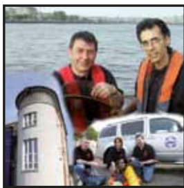
Foyle Search & Rescue