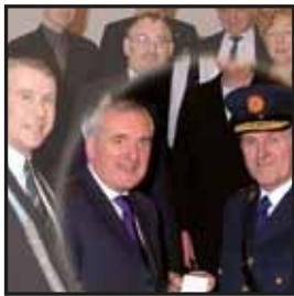
An Garda Síochána